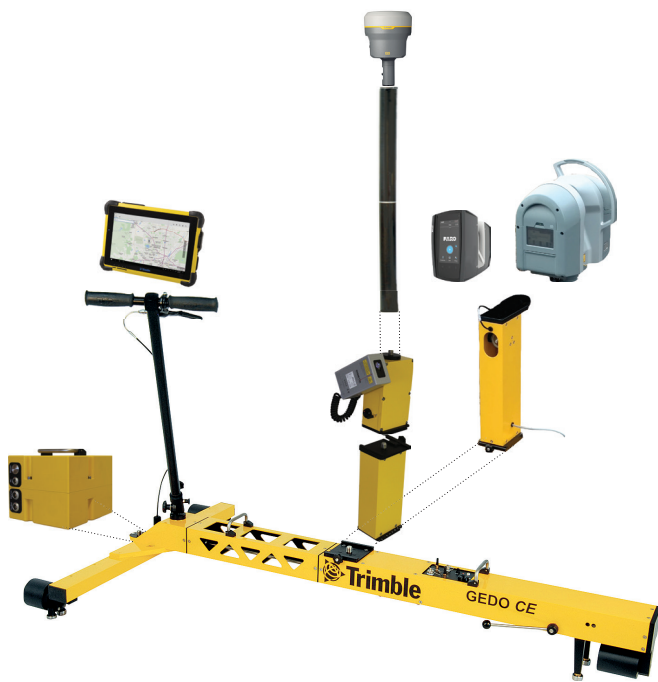
Specifications subject to change without notice.

Operating system ..... Microsoft Windows® 7 Professional Operation ..... Touchscreen Interfaces ..... HDMI, USB 2.0, Bluetooth® 4.0, WLAN(b/g/h) Environmental Protection ..... IP65; MIL-STD-810G Temperature range ..... -30°C to +60°C Weight ..... 1.4 kg