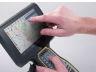
7" multi-touch screen