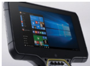
Windows 10 Pro OS